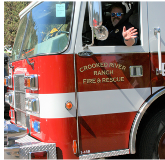
4th of July Parade