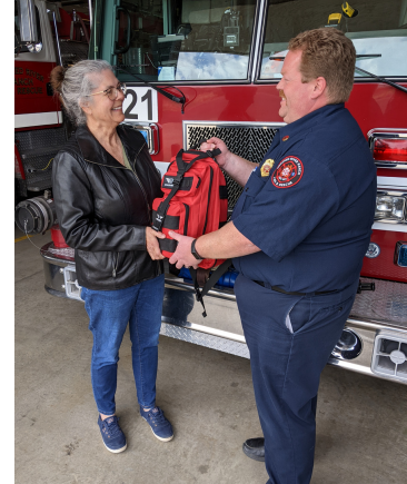
Emergency Preparedness Open House